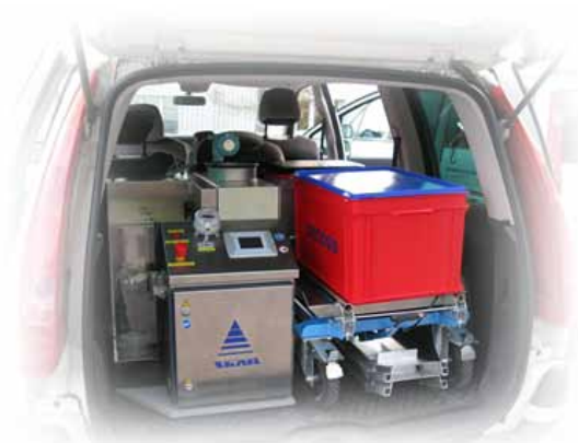
Mobility, transport in a van