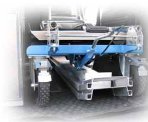
Roll lifting cart